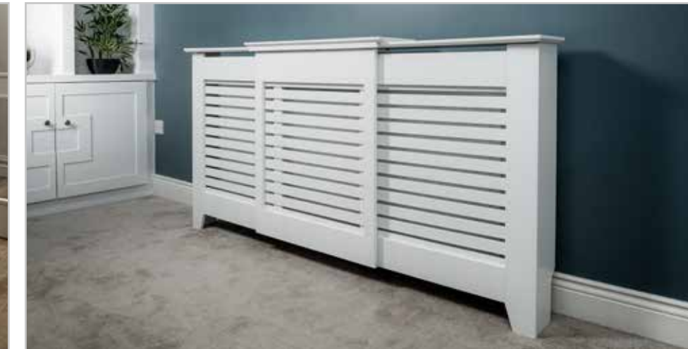
Contemporary Adjustable Medium Contemporary Adjustable Large