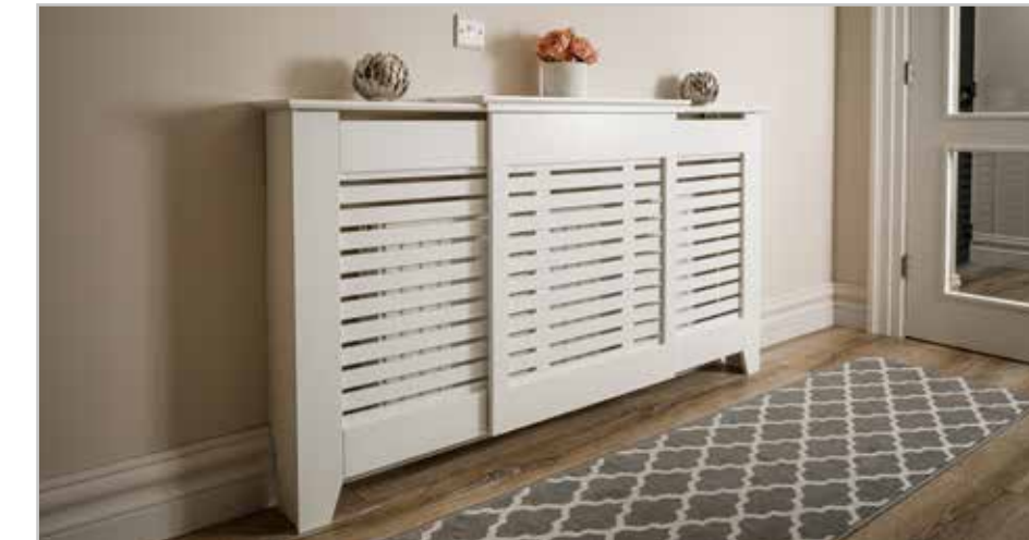
Available in medium and large, See size chart on page 16 & 17

Complete with modern slatted grill, the Contemporary Adjustable is a Radiator Cover that will perfectly compliment the modern home. With its adjustable width for a perfect fit and contemporary design, it has become a very popular choice for contemporary style homes. Comes with easy click assembly and wall fixings.